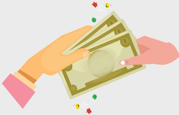
A healthy person receives the cash