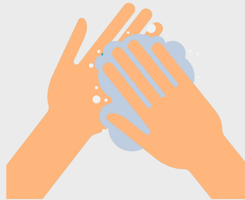
Keep washing your hands