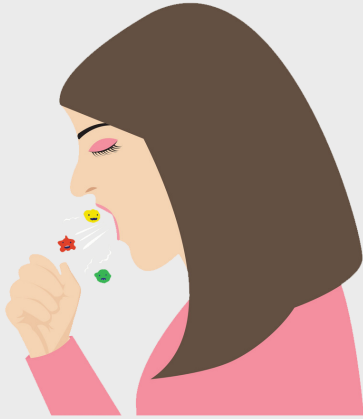
An infected person coughs into hands