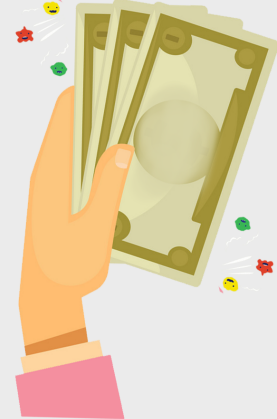
Handles cash without any hand hygiene