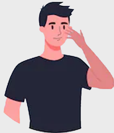
Touches his nose/ mouth/eyes without following hand hygiene and gets infected