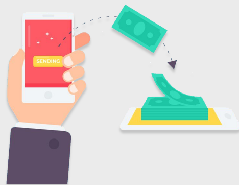
Make online payments instead of cash